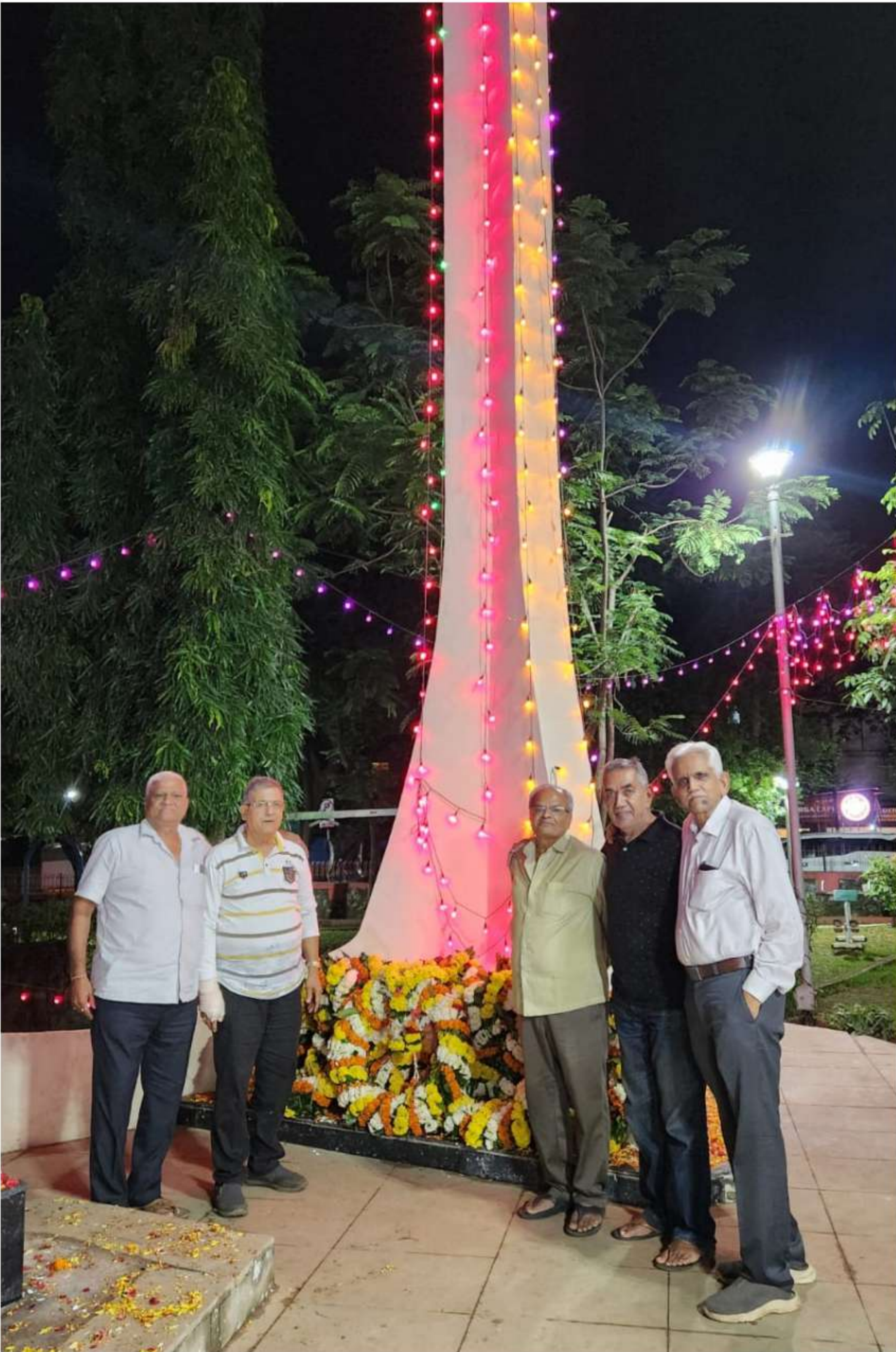
FRIENDSHIP OF 60 YEARS AND STILL GOING STRONG- “ये दोस्ती हम नही छोड़ेंगे