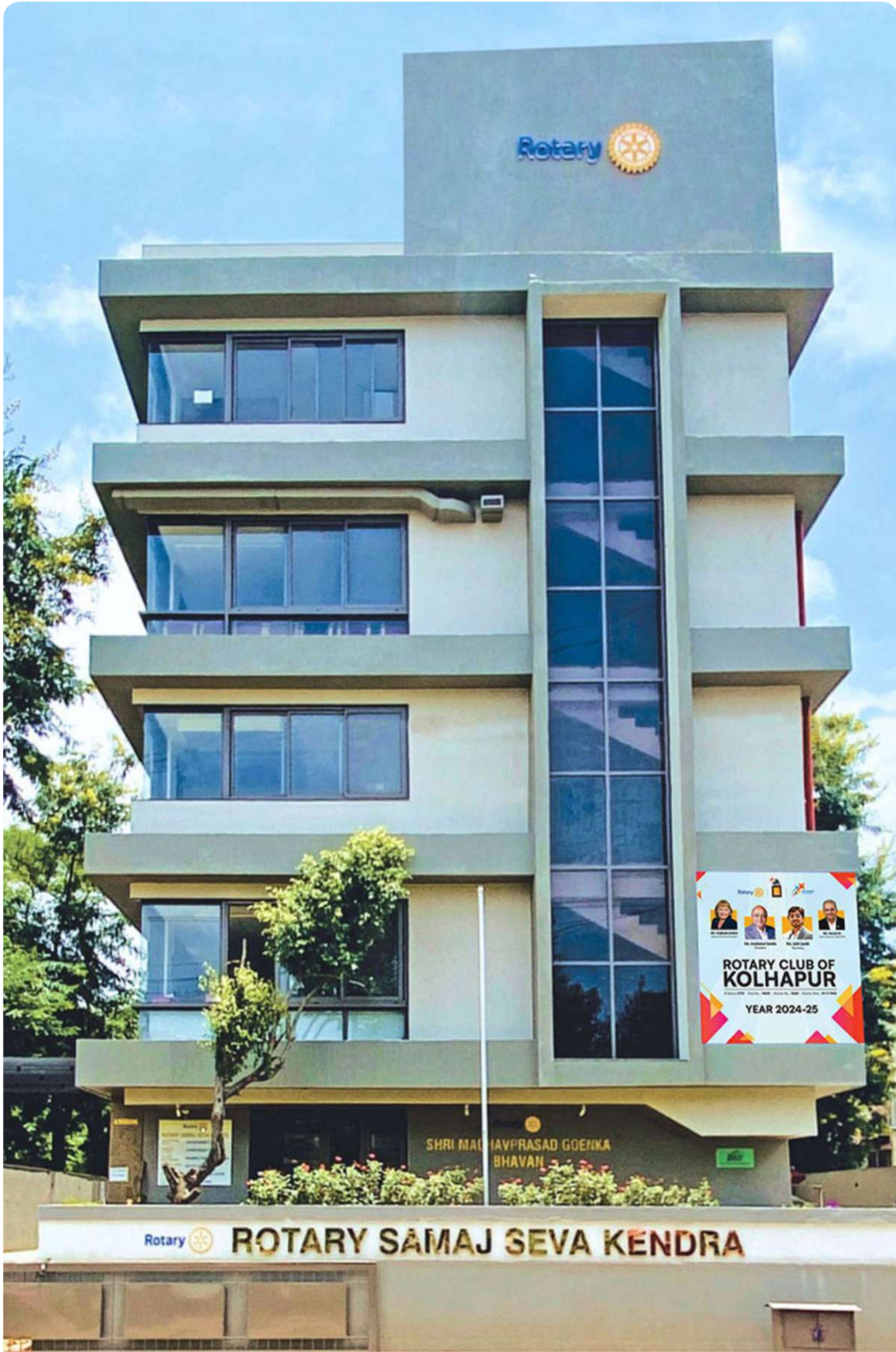
ROTARY CLUB OF KOLHAPUR'S ROTARY SAMAJ SEVA KENDRA BUILDING